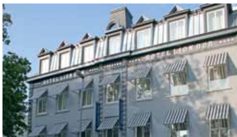
Golden Tulip Hotel Lion d'Or

Service, style and comfort all abound at the four-star Hotel Lion d'Or, located in historic Haarlem. With 32 rooms, two junior suites, a bar and a brasserie, Lion d'Or also has three multifunctional meeting rooms, suitable for conferences, seminars or receptions, as well as for private luncheons and dinners for groups from six to 120. Easy and frequent public transport to and from Schiphol Airport. Kruisweg 34, 2011 LC Haarlem (+31 [0]23 532 1750/hotelliondor.nl).