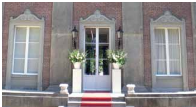
Lead the luxe life at Landgoed Eikenrode