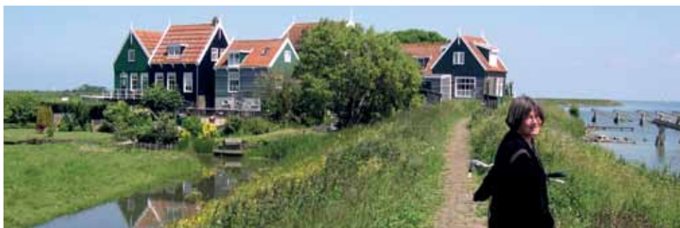
AMSTERDAM TOERISME & CONGRES