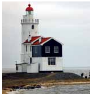
AMSTERDAM TOERISME & CONGRES

Your legs may be aching, and if they are, now's the time to consider your options. You could catch the ferry to the perfectly preserved 'theme park' village that is Volendam, or if your legs are up to it, you could venture as far as the cheese Mecca of Edam. But whether you make it all the way to Edam or turn back at Durgerdam (40km is no walk, or cycle, in the park), this bike ride into the past gives a hint of what the Netherlands has to offer.