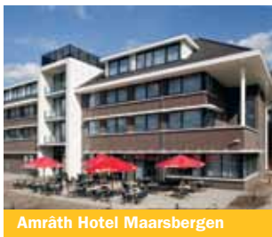
Amrâth Hotel Maarsbergen

Looking for a MICE location near Utrecht? The four-star Amrâth Hotel Maarsbergen is ideal. Situated in the beautiful Utrechtse Heuvelrug National Park, Amrâth Hotel Maarsbergen has eight function rooms, which can accommodate meetings for up to 170 people, and various sporting, educational and cultural trips can be arranged upon request. Woudenbergseweg 44, 3953 MH Maarsbergen (+31 [0]34 347 5522/hotelmaarsbergen.nl).