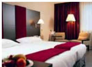
NH Schiphol Airport

The four-star NH Schiphol Airport is conveniently located just ten minutes from Amsterdam Schiphol Airport, offering great connections to the rest of the country by car and public transport. The hotel has 419 modern air-conditioned rooms and fifteen fully equipped, multifunctional conference rooms, which can accommodate five to 500 people. With innovative modular walls, rooms can be separated or joined together in numerous configurations. The hotel offers complete conference services, from registration staff through translators to custom catering. Kruisweg 495, 2132 NA Hoofddorp, Amsterdam (+31 [0]20 655 0550/nh-hotels.com).