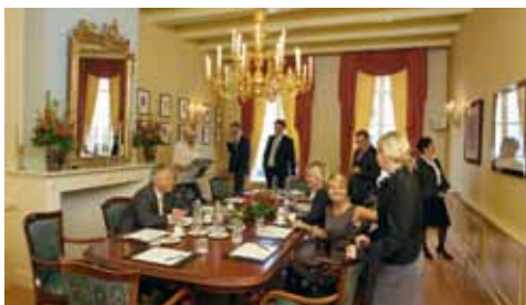
Grand Hotel Karel V