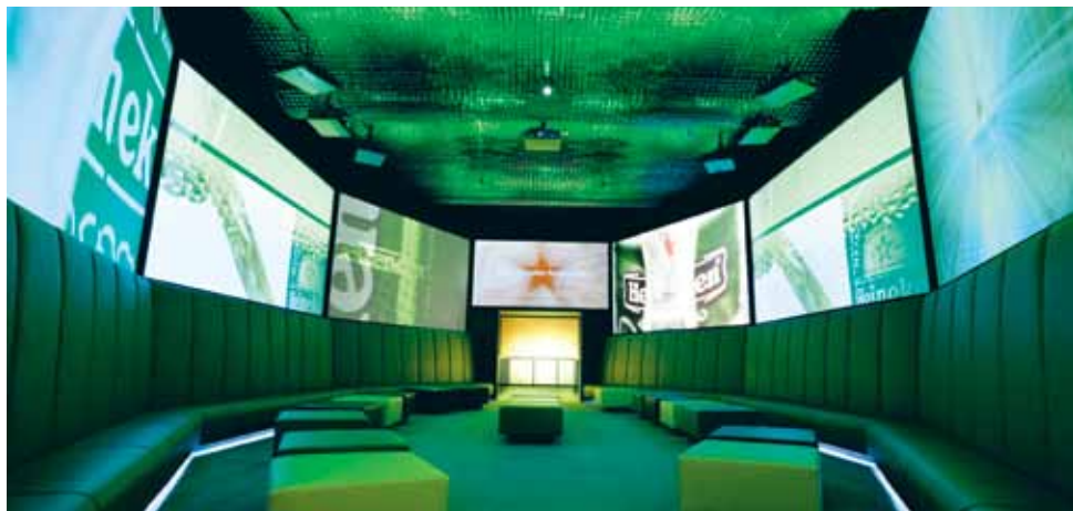
The Heineken Experience